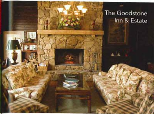
The Goodstone Inn & Estate

the property; guests are even invited to bring their own horses. But, most importantly, visitors are blown away by Goodstone's welcoming staff.